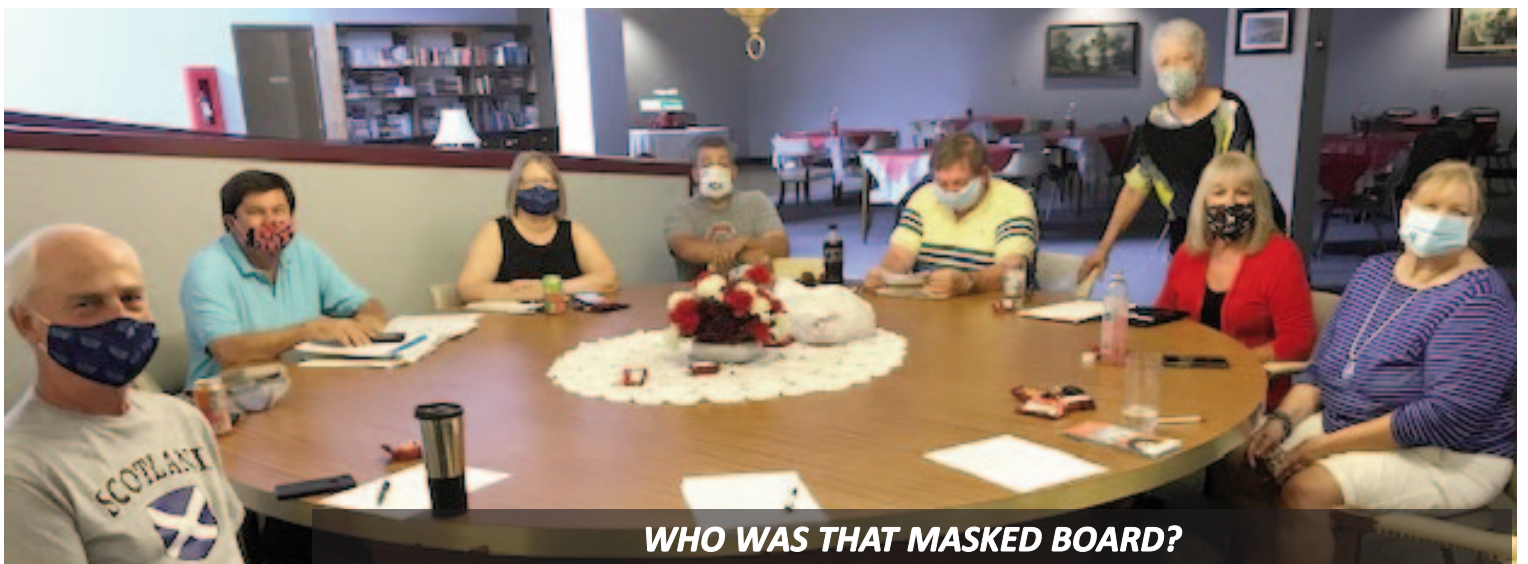
WHO WAS THAT MASKED BOARD?

Like and follow Celtic Newsbytes on Facebook